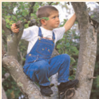
He was able to climb up the tree.

Can is used in the present and future. Could is the past tense of can . We use be able to to form all the other tenses.