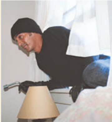
The owners shouldn't have left/ought not to have left the window unlocked.

◆ should/ought + perfect infinitive = it would have been better if you had ... We use these structures to criticise someone else's actions. e.g. You should have come/ought to have come to me for help. (But you didn't.)