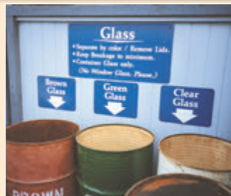
Everyone should recycle their rubbish.

We use must to refer to the present or future.